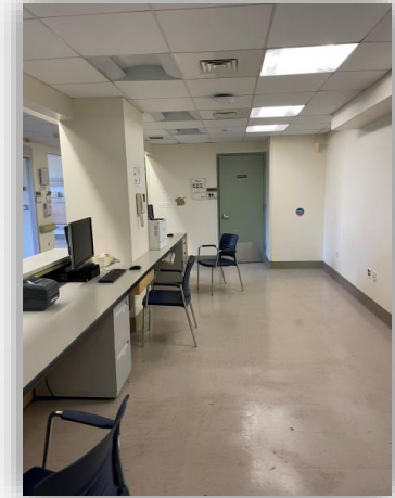
"recharge" space on 3 Linsky.