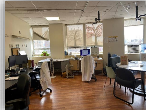
Resident offices in the unit. Rooms are secure.

6 Karpas: Room 6L-03 and Room 6S-28 and on unit (private office)