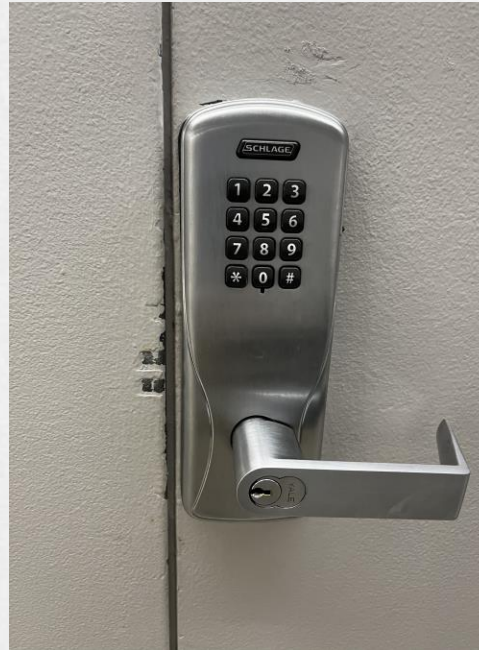
Resident Room (located beside the Evaluation Unit) - secure/locked with a passcode