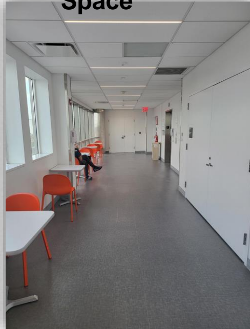
Students can study in the staff lounge although due to the nature of the rotation, students will generally not have downtime and are only at the hospital for 8 hours