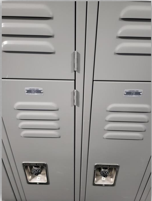
Closet/Cabinet in Staff Lounge