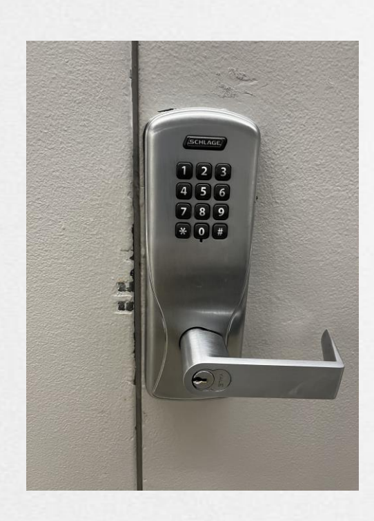
Resident Room (located beside the Evaluation Unit) - secure/locked with a passcode