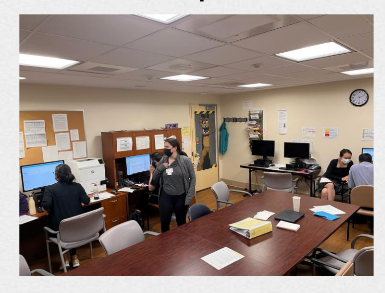
Computers for use are in the team rooms on each unit